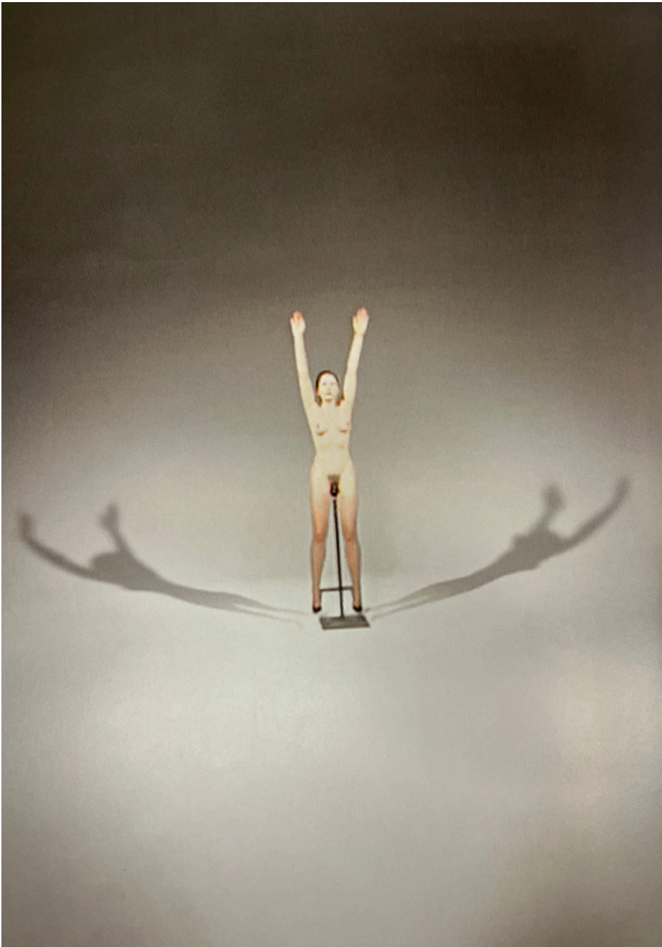
expanded perspective and imposing structures

genesis a visual perspective scene composition styling conclusion