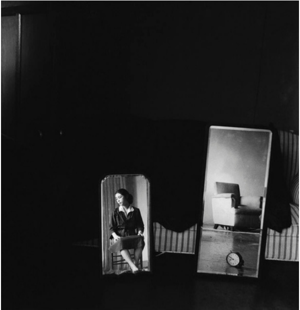
the mirror and the lamb.