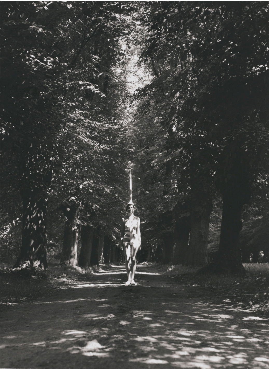
tying nature's cycles of bloom and decay to marina abramović's themes of life, death, and rebirth.

genesis a visual perspective scene composition (02) styling conclusion